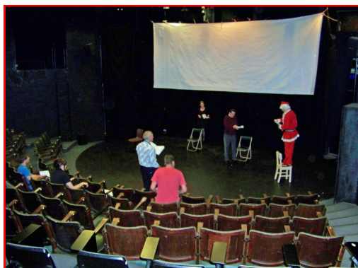
[LEFT] LEO DIRECTS A SCENE FROM THE PLAY