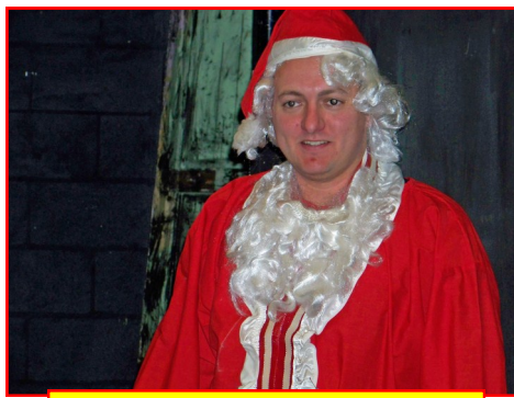
THERE HAS TO BE A SANTA