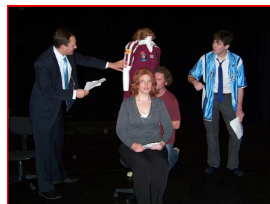
[LEFT] 'DRIVING' ON THE STORY BRIDGE