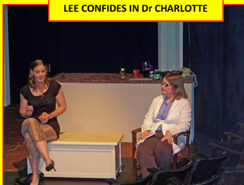
LEE CONFIDES IN Dr CHARLOTTE

Play No.2 for the 2011 season, Marvin's Room closed recently to much critical acclaim. The play told the story of two sisters, Lee and Bessie, who learned to understand each other more, during the course of the play.